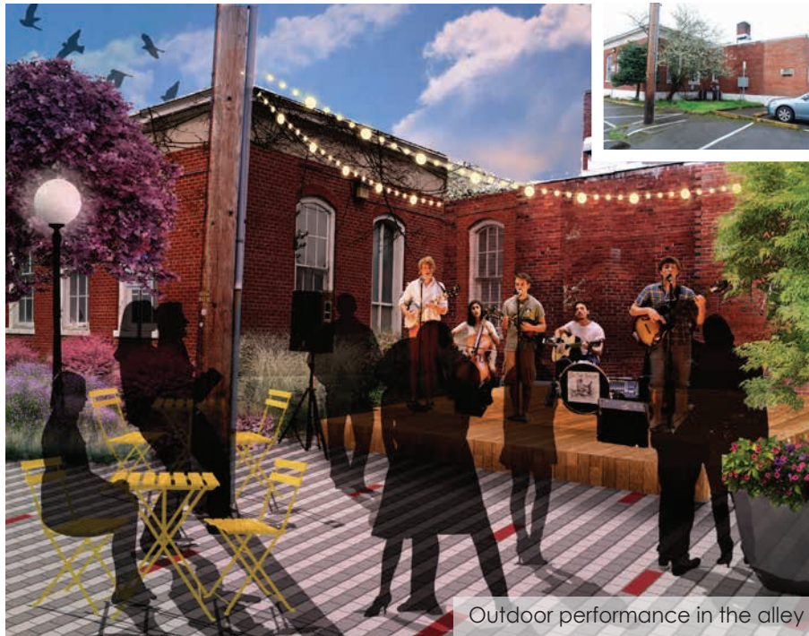
Outdoor performance in the alley