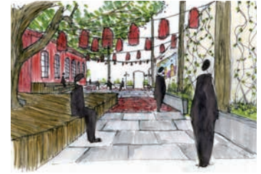
Preliminary Design Concepts

AFFILIATION: University of Washington, Liveable City Year