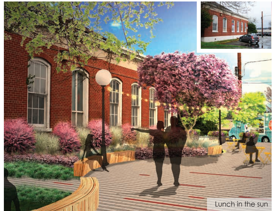
Lunch in the sun