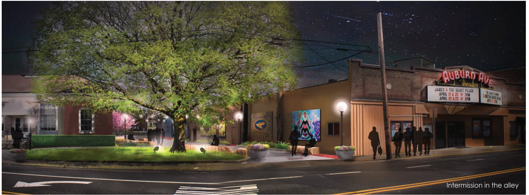
Intermission in the alley